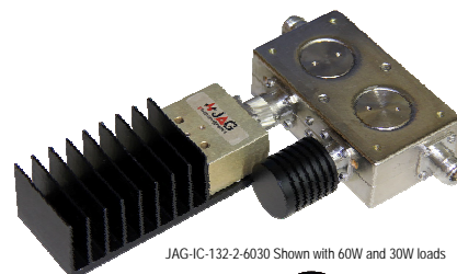
JAG-IC-132-2-6030 Shown with 60W and 30W loads